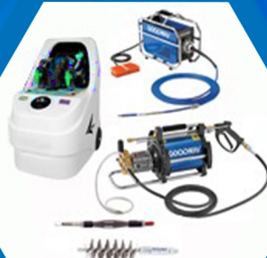
Cleaning Equipment & Accessories