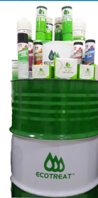
Bio Degradable Cleaners